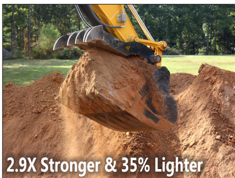
2.9X Stronger & 35% Lighter

AR400 steel construction reduces weight up to 35% and makes the bucket 2.9X stronger which means you can move even more payload with a coupler or thumb and handle rough jobs with ease.