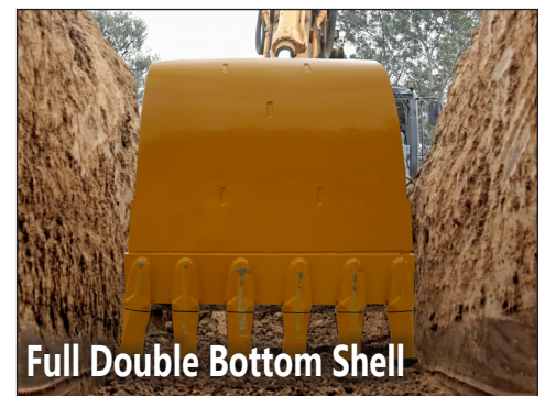
Full Double Bottom Shell

Reduces offset and maximizes machine geometry for better fill and dump cycle performance while supporting machines power allowing you to improve productivity.